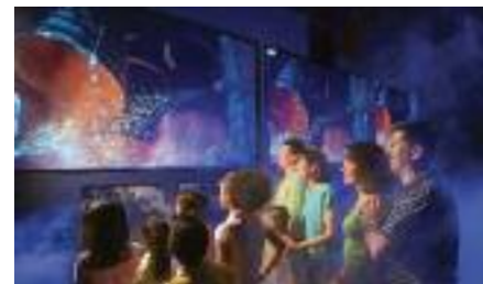
Blastoff Theater, NASA Space Center Houston

Located in Lubbock where many World War II "silent wing" glider pilots trained, this 40,000-square-foot museum contains one of the only four fully restored Waco CG-4A gliders in the world, an engine-less Aeronca L-3 trainer, historic photographs, and three galleries filled with weapons such as the M1 Garand infantry rifle, original and authentic reproduction uniforms, and battlefield souvenirs. Visitors can also watch curators restore a British Horsa glider and a 15-minute video on the U.S. WWII glider program. Lubbock (806) 775-2047 or www.silentwingsmuseum.com