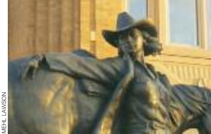
High Desert Princess in bronze, National Cowgirl Museum and Hall of Fame

Located one mile from the site of the famous Lucas gusher of 1901 that started Beaumont's oil boom, this five-acre outdoor museum contains 15 replica buildings of the old Gladys City boomtown, includ-