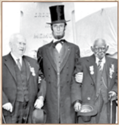
YORK COUNTY HERITAGE TRUST