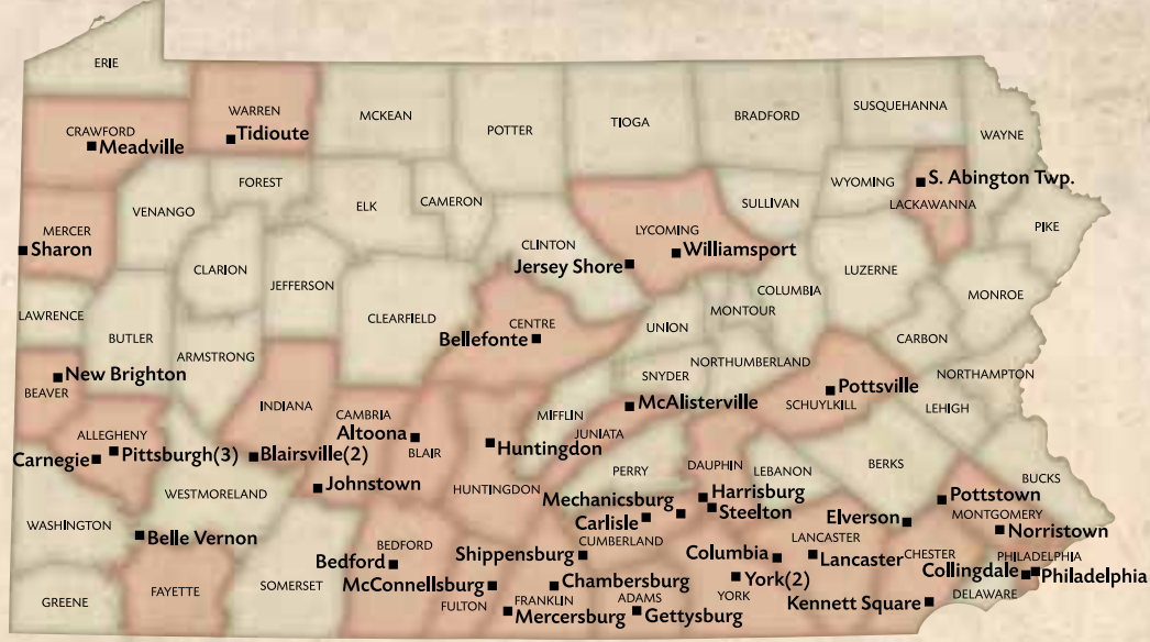
MAP: MARTIN WALZ