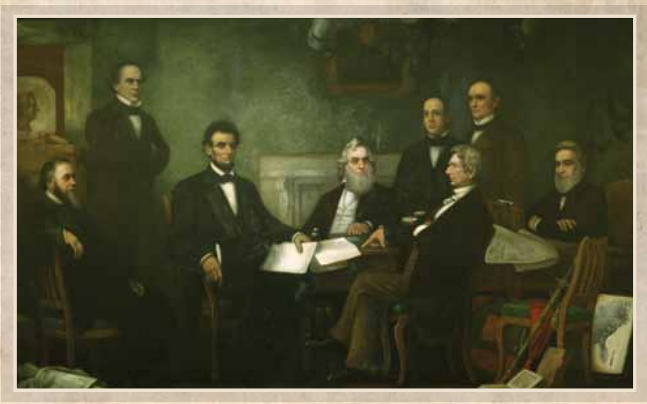
U.S. SENATE COLLECTION

THE EMANCIPATION PROCLAMATION OPENED THE DOOR FOR PENNSYLVANIA'S AFRICAN AMERICAN SOLDIERS