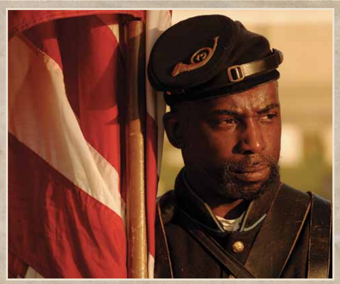
A REENACTOR FROM THE 3RD U.S. COLORED INFANTRY REGIMENT